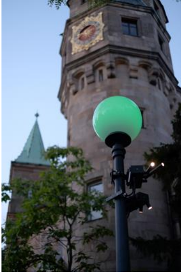
Fig. 1: Siegrun Appelt chose the SUPERSYSTEM outdoor modular LED luminaire to provide targeted illumination and energy-efficient lighting for the facades, gardens and pathways.