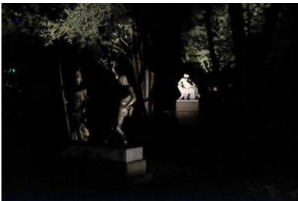
Fig. 3: On first entering the garden, it takes a moment for the eye to get used to the reduced light intensities, as the subtle artificial light in the garden contrasts with the strong illumination of the surrounding urban space.