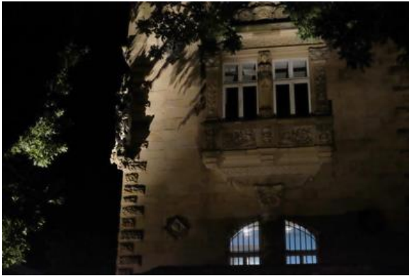
Fig. 5: A total of 15 luminaires have been installed to illuminate the garden, pathways and facades of the Liebieghaus.